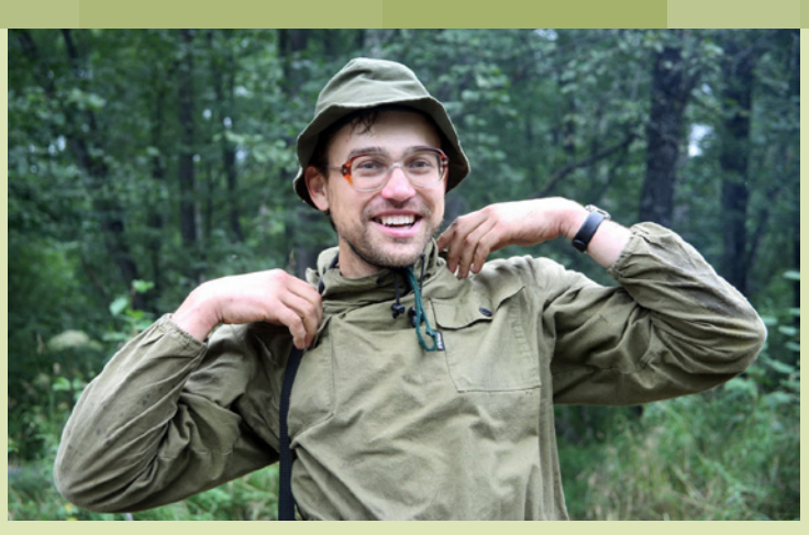
Be prepared, Victor Petrov! (Photo: Kola Biodiversity Conservation Centre).

In the framework of the GAP-analysis, some of the planned protected areas were assessed as areas of high conservation