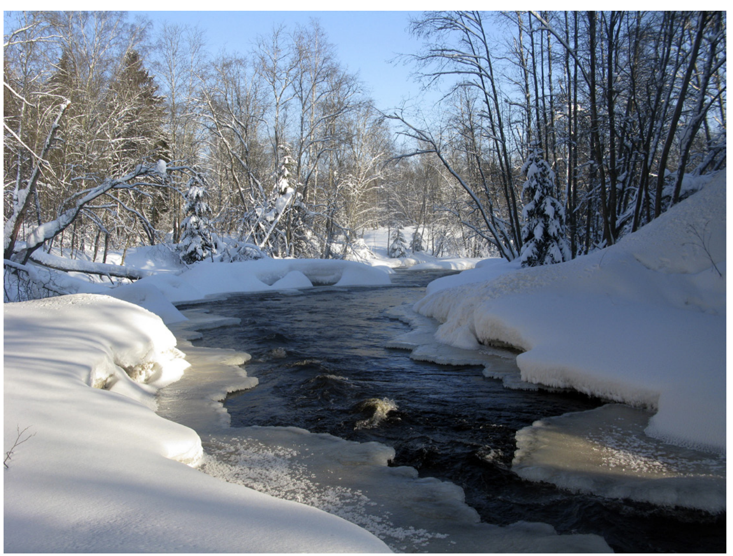
Gladyshevsky nature reserve is important for the protection of Atlantic salmon and freshwater pearl mussel.

The five-year management plan of the Gladyshevsky nature reserve comprises of (1) proposals for conservation and restoration of high conservation value areas and species, (2) programme for re-establishing rare aquatic species and (3) draft regulations for the Gladyshevsky nature reserve within St Pe-